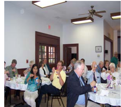
Can everyone blow bubbles?