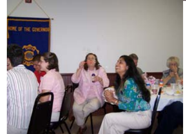
Dreaming is like blowing bubbles